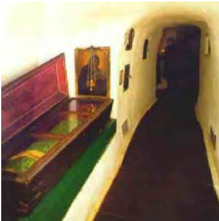
A passage in the Caves of Lavra, where entombed saints still draw throngs of tourists and pilgrims.