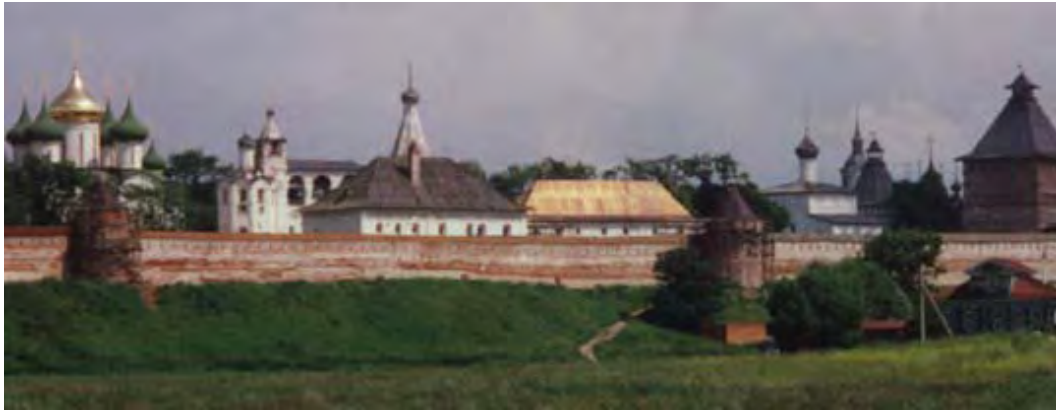
A view of the Susdal Monastery from outside the perimeter walls.

Tears were shed in Archangelsk when word of his banishment reached those who loved him. For his parents, the news was a mortal blow. Three months later his mother died of grief, and soon afterward his embittered father, who made repeated unsuccessful petitions on his son's behalf, gave up and died of a broken heart too.