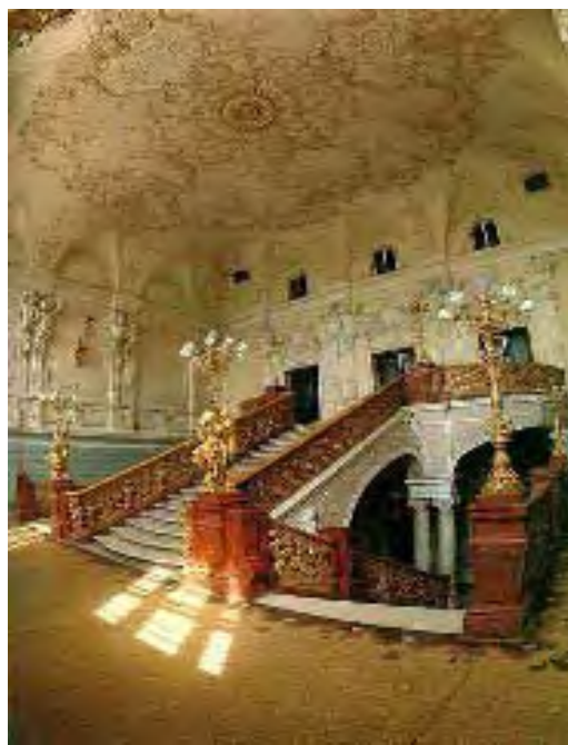
The marble foyer of the Odessa Opera House, a stunning example of baroque architecture.

That night Rachoff sequestered himself and prayed for hours. He remained alone the next day too. Then, in the evening, he went into Odessa, to the grandeur: the Rachoff could more out of brightly lit opening night, he turned, there be seen. Ornate, carriages came bursing smiling gowns. Trim es- in tails and top tapped paving